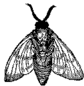
Figure 2: A sample black and white graphic that has been resized with the includegraphics command.

caption. And don't forget to end the environment with figure* , not figure !